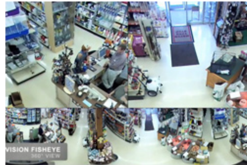
Dewarped Image: 2 PTZ views & 1 360 degree view