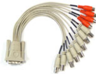
8 cam video cable