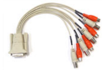
4 cam video cable